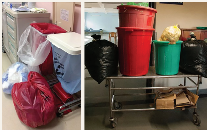
1 phaco (USA)